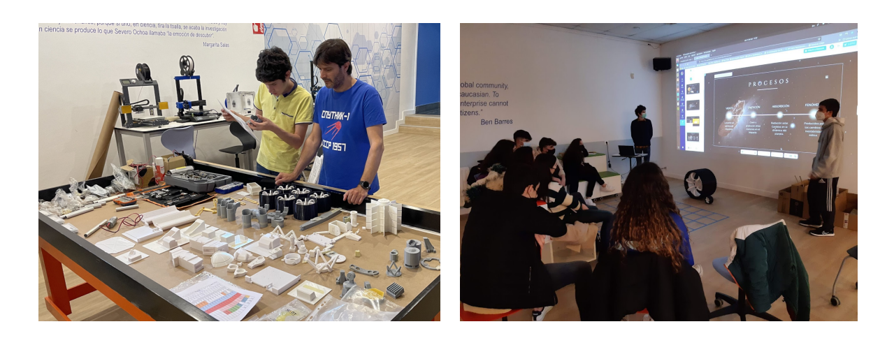
Figure 1: Two types of sessions in the project: The engineering sessions (left) ordering the more than 150 pieces made by the different institutes. The scientific sessions (right) with the presentation of the different topics to the rest of the students.