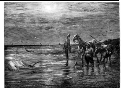
Illustration by Gustave Doré

We need your support. In order to vote this proposal sign up and follow the procedure at: http://nameexoworlds.iau.org or www.estrellacervantes.es