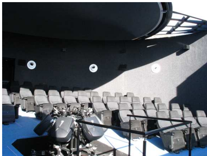
Figure 5: View of the Eye of Montsec with its retractable dome partially opened.