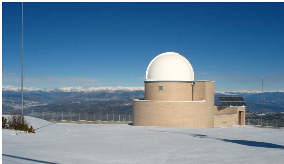
Figure 2: View of the Observatori Astronomic del Montsec during winter.

of the whole Catalonia. Ground-based studies show that Montsec skies are 80 times darker than the Barcelona sky and Montsec skies are considered free of light pollution (natural sky) and are specially protected by light pollution Catalanian law.