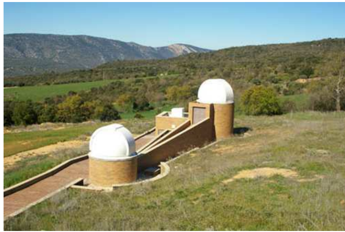
Figure 4: View of the two domes of the telescopes park.

astronomical domes (see Fig. 4) and an area for setting up the COU's portable telescopes. The equipment of the park consists of: