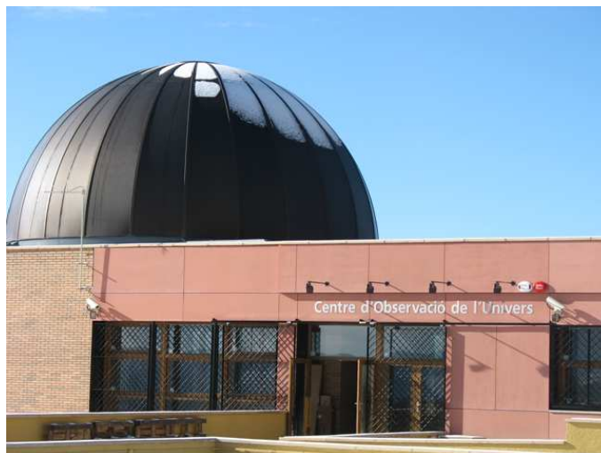
Figure 3: General view of Centre d'Observació de l'Univers .

and secondary students, university students and general public. The center was inaugurated the 16th of January of 2009 and started all the activities during the firsts months of the International Year of Astronomy.