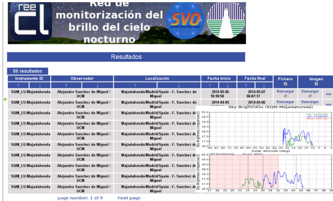
Figure 2: Result of a query and visualization of results in the SVO sky brightness archive.