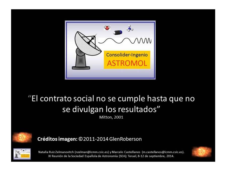
Figure 5: "The social contract is not complete until the results are not communicated", Jacqueline Mitton, 2001 [4].