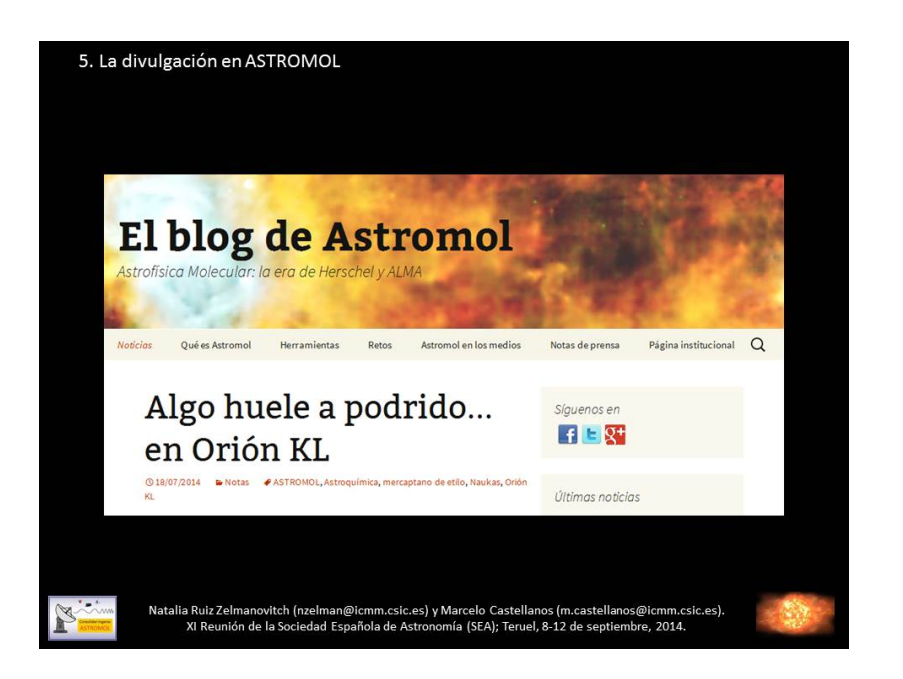
Figure 4: ASTROMOL Outreach blog.