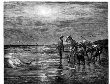
Illustration by Gustave Doré

We need your support. In order to vote this proposal sign up and follow the procedure at: http://www.nameexoworlds.org/#signup or www.estrellacervantes.es